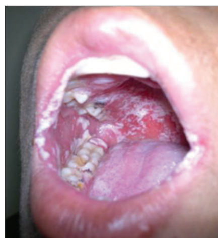
Figure 1: Pseudomembranous candidiasis