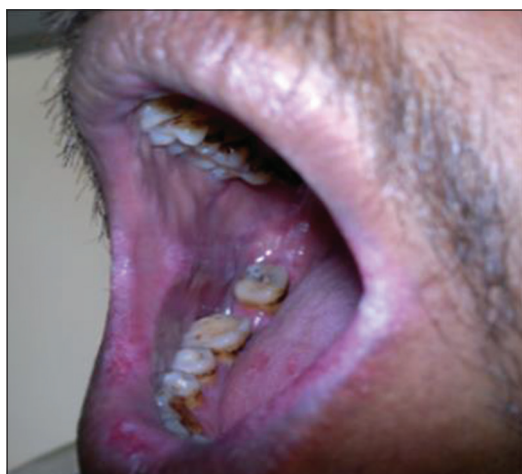
Figure 2: Melanotic hyperpigmentation